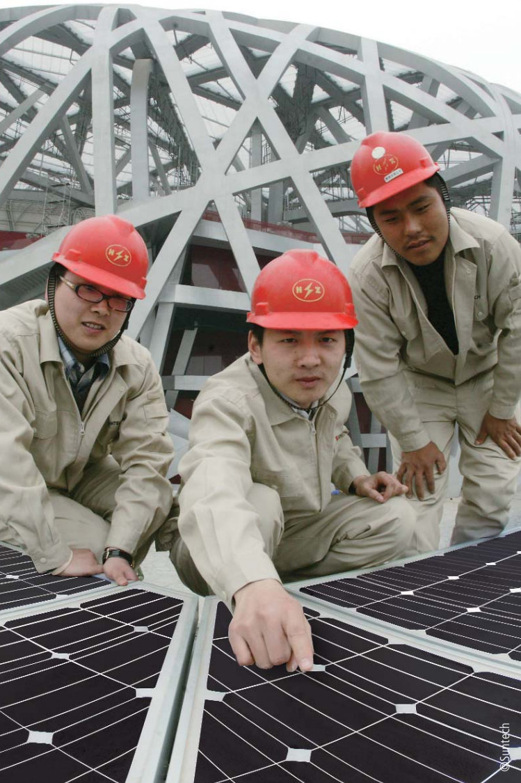
PHOTO: PV modules on the Beijing National Stadium.