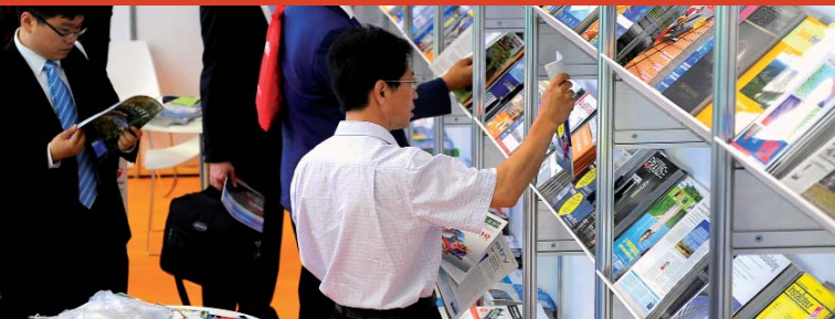
PHOTO: Intersolar offers first hand industry news.