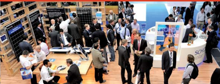
PHOTO: Latest products and technologies presented at Intersolar.